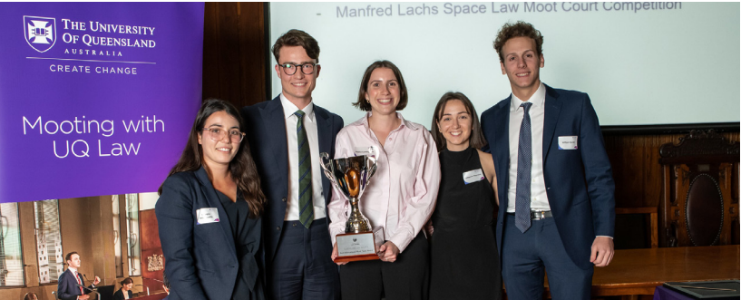
The Queensland Law Society 2022 Best International Moot Team Award was presented to the Philip C. Jessup International Law Moot Court Team.