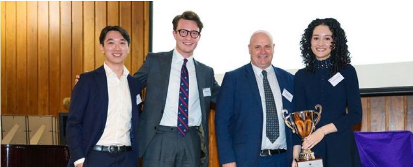
The Queensland Law Society 2023 Best International Moot Team Award was presented to the Willem C. Vis International Arbitration Moot Team.