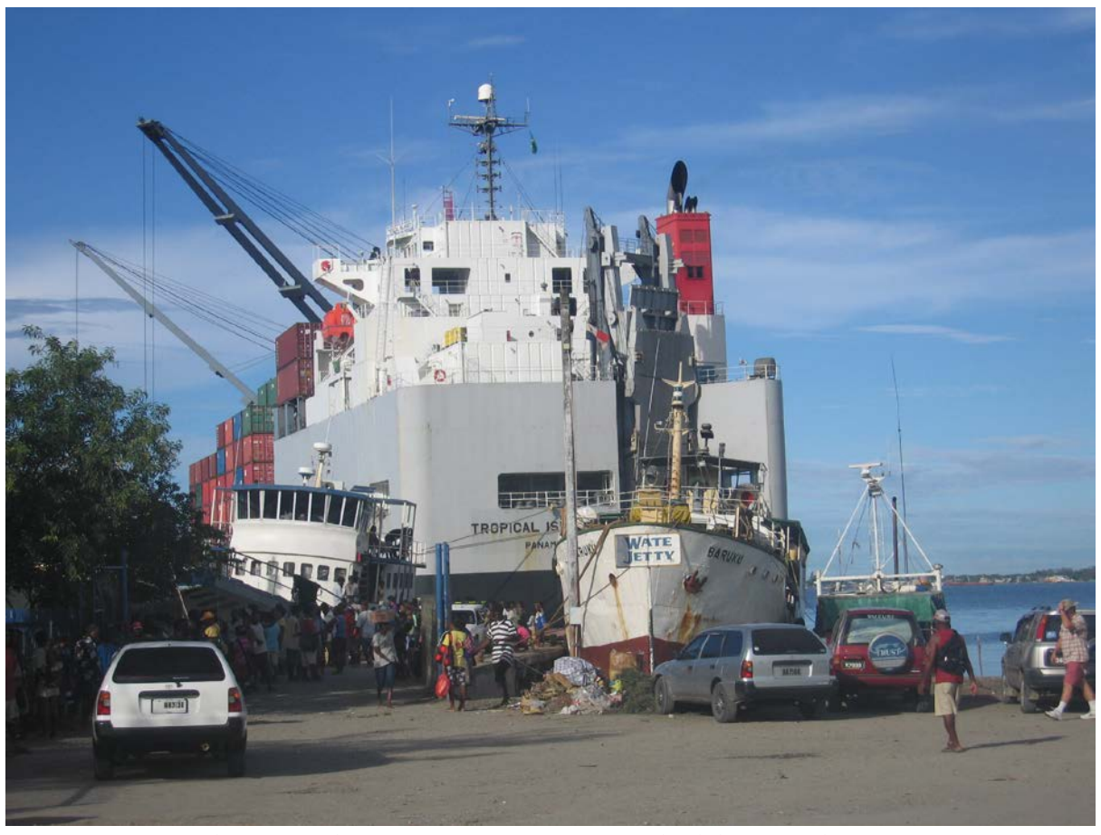
9.6. An international container ship at Point Cruz, next to inter-island shipping. This scene was in 2012.