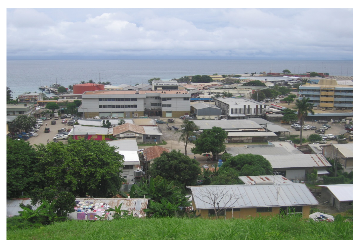
9.4. Point Cruz in 2008. This is the commercial and administrative hub of the nation.