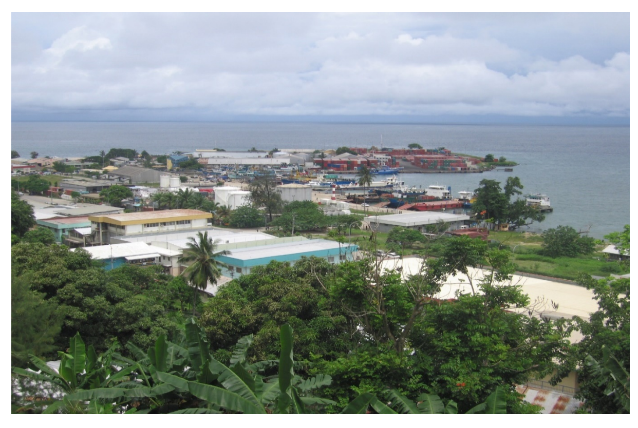
9.5. Point Cruz and the centre of Honiara, looking down from the ridges behind, 2008.