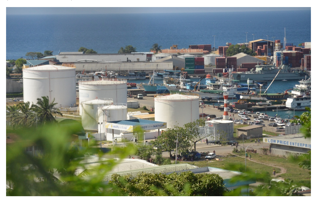
9.7. Point Cruz in 2014, showing the fuel depot, the docks for local shipping and the main wharf where overseas shipping arrives.