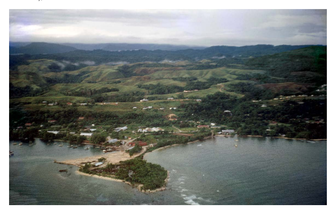
9.3. In the 1940s and 1950s, Honiara had no port, other than small wharves at Kukum. Since the 1950s, Port Cruz has been expanded and made into an extensive area of docks for international and local shipping. This photo shows the early stages of the development in the 1950s.