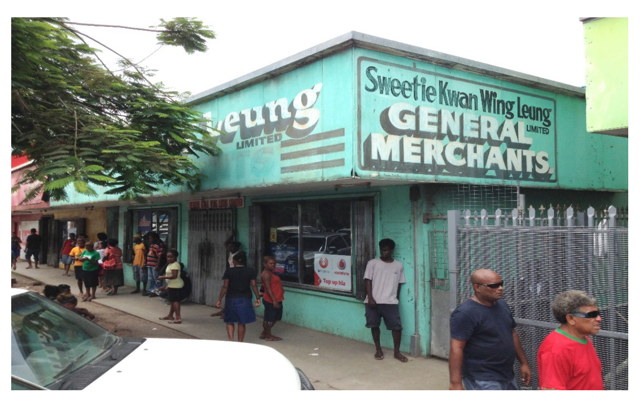
9.8. One landmark at Point Cruz is Sweetie Kwan Wing Leung Ltd. General Merchants, Mendana Avenue.