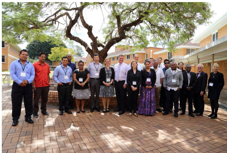
Pacific Islands Regional Marine Spill Contingency Plan Workshop delegates at Emmanuel College UQ