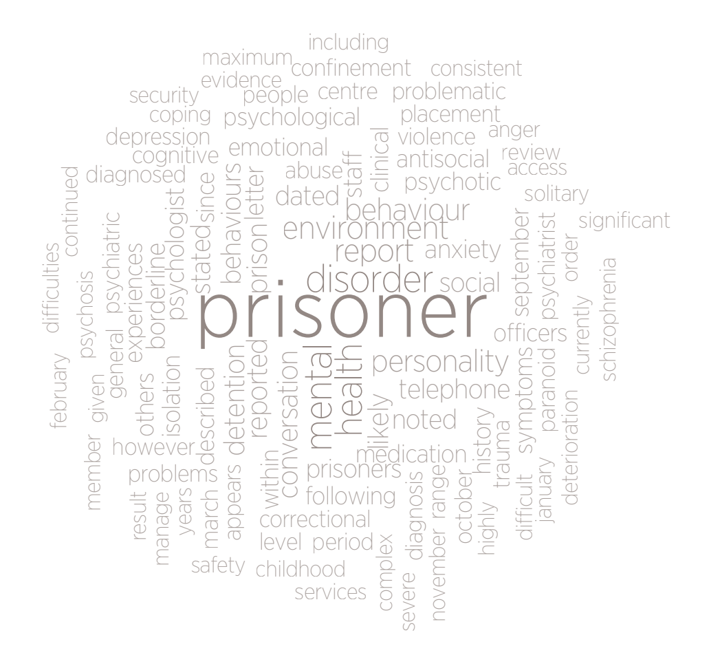
Figure 5.1: 100 most frequently used words of five letters or more, generated by NVIVO

The ten most frequently used words with five letters or more within the files, in order of frequency, were: prisoner, mental, disorder, health, report, environment, personality, behaviour, conversation, prison. The 100 most frequently used words with five letters or more are represented in the word cloud below.