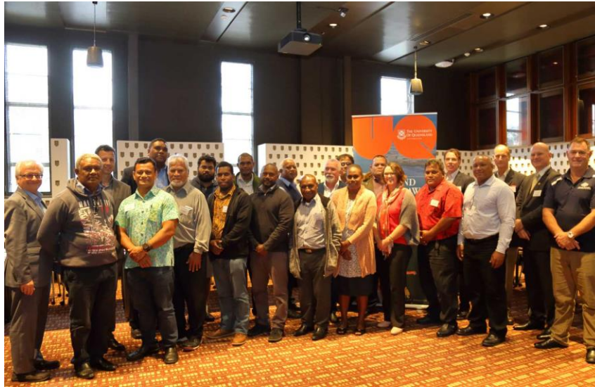
PACPLAN participants and convenors- School of Law

(PACPOL), which is the primary mechanism for a number of Pacific Island States to seek assistance from Australia in the event of a marine pollution incident.