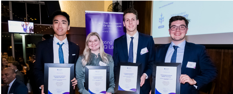
The Queensland Law Society 2021 Best Moot Team Award was presented to the Willem C. Vis International Arbitration Moot Team.